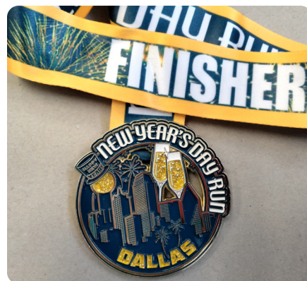
The New Year's 5K race finisher's medal