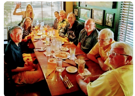
The Board met at Saltgrass after the first day of the board meeting