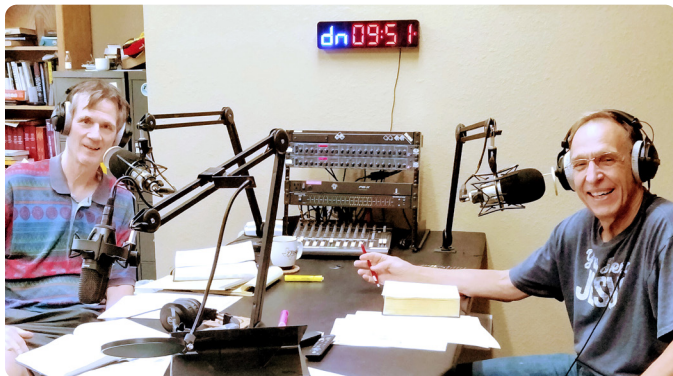
Is this a comedy show? These jokesters can't stop cracking up