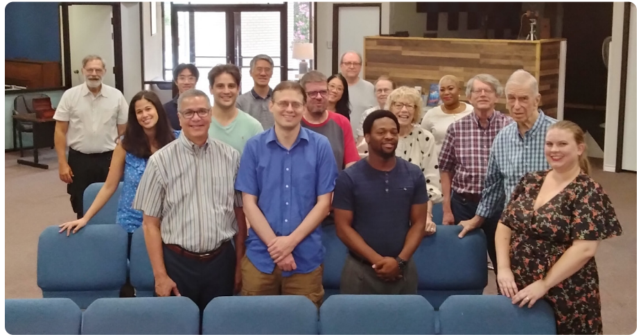
The congregation at Vista Ridge Bible Fellowship, July 9th