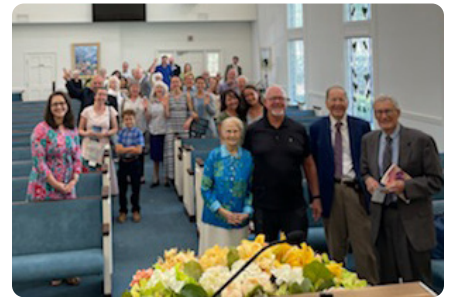
The good folks at Bayside Community Church in Tampa