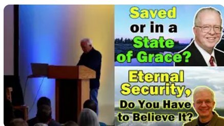
Find Bob Bryant's message, "2006 Revisited: Eternal Security, Do You Have to Believe It?" (June 10) on YouTube

We just went over 8,000 subscribers. In fact, today (June 28), we are at 8.02k. While numbers are not proof that we are doing well, they indicate that we are getting the message out to many people.