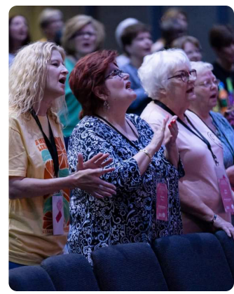
Ladies worshipped at the "Better Together" women's conference at CVBC