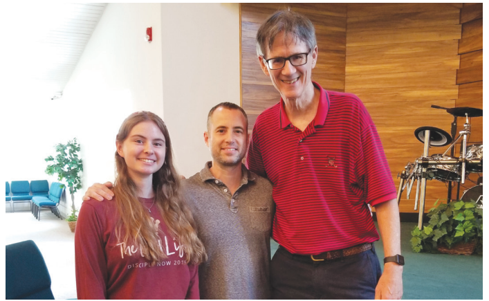
Objects in mirror are larger than they appear.