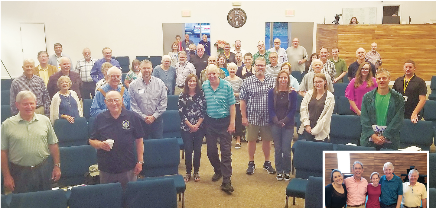
North Carolina Regional