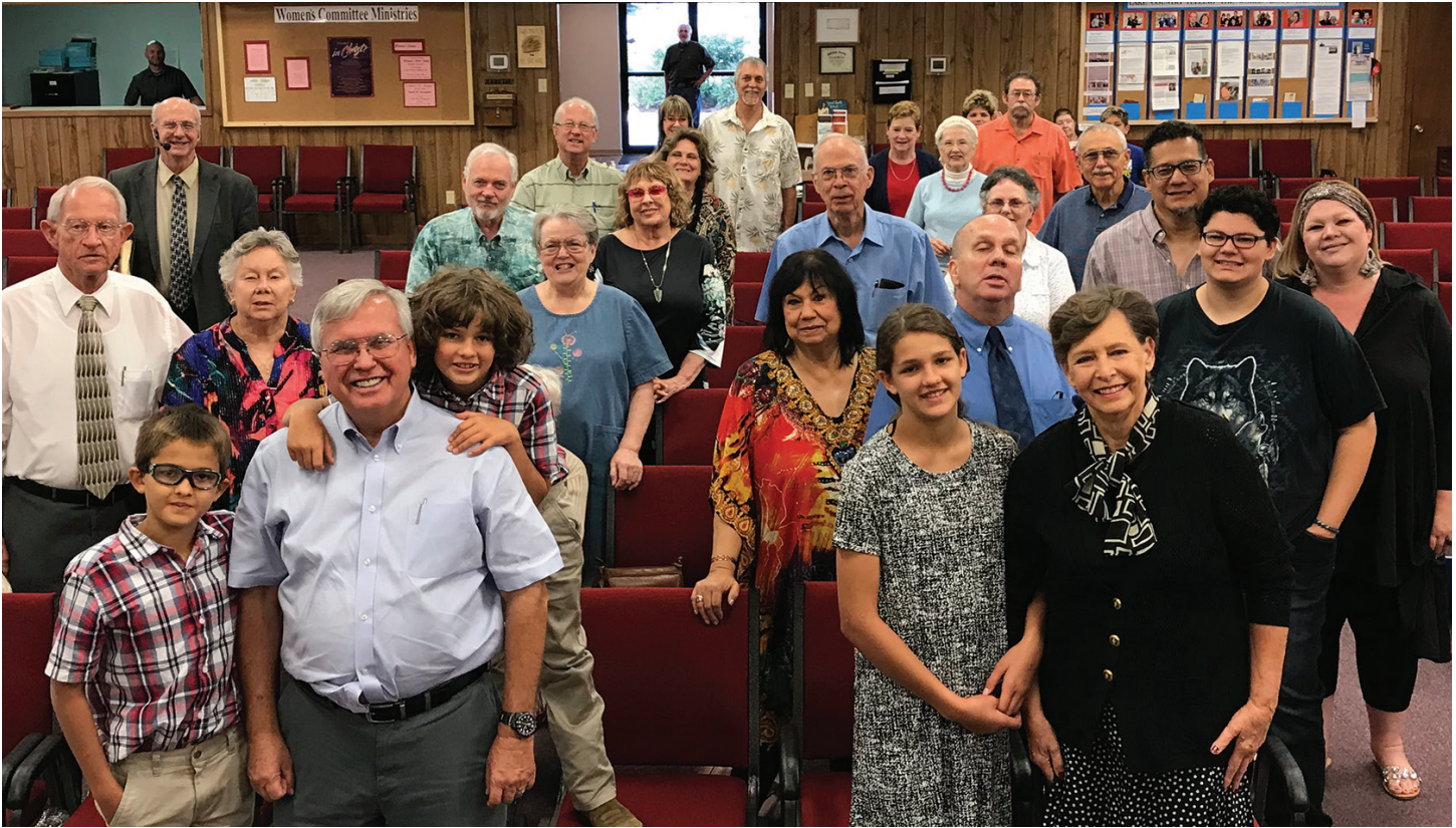
Pray for Lake Country Bible Church as they seek a Free Grace pastor