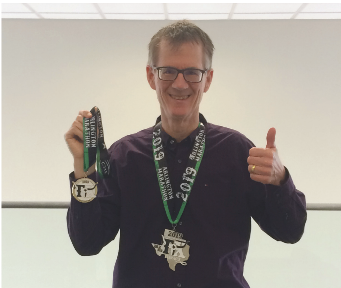
Run to win!