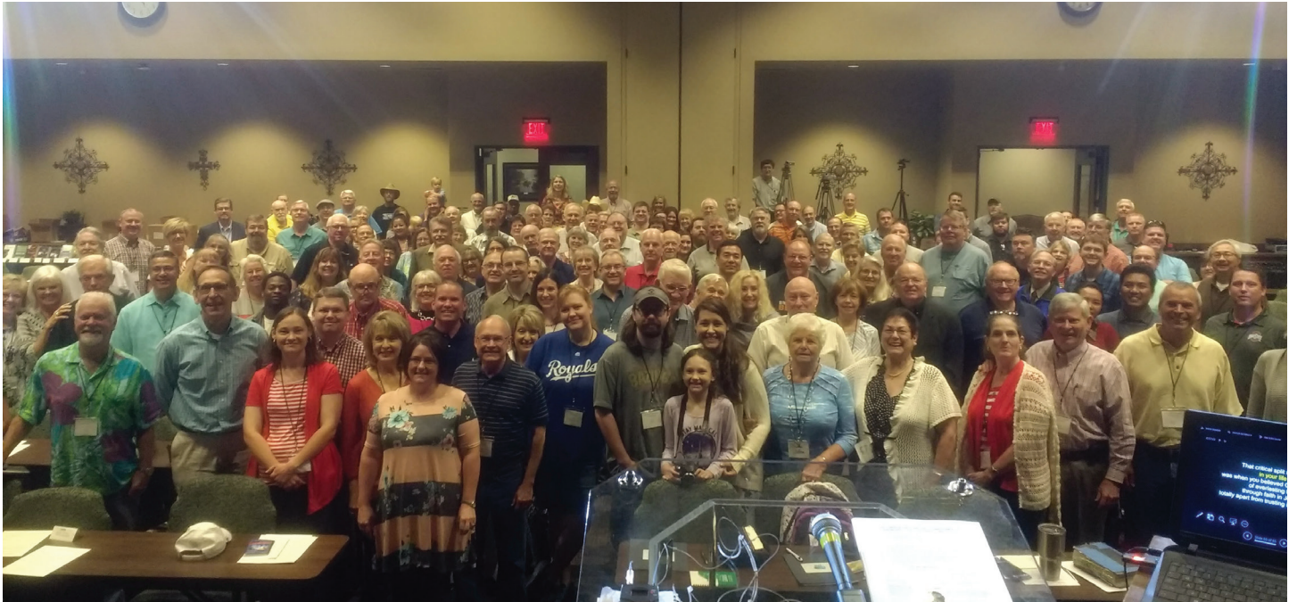
We had a great turnout at a great venue!