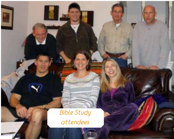
Bible Study attendees