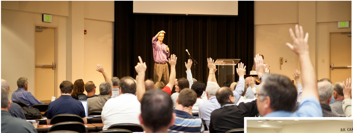
"Who wants a delicious sardine?"