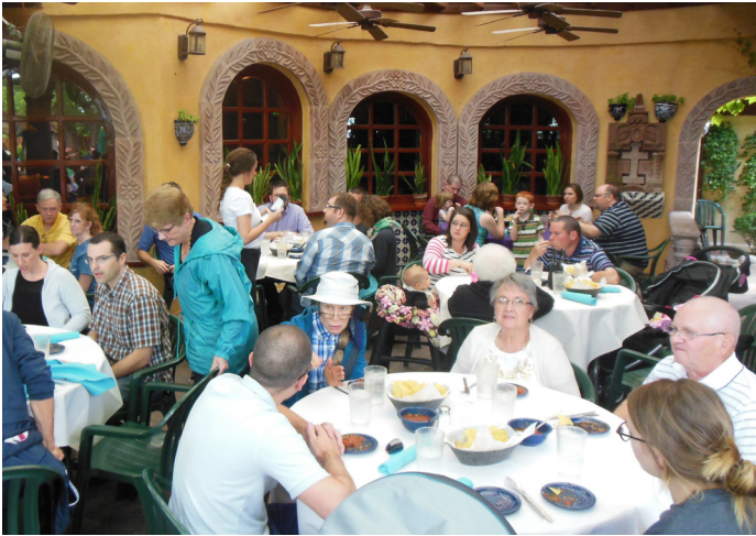
Mexican dinner at Joe T. Garcia's near the Fort Worth Stockyards. Fellowship is half the reason for the Conference!