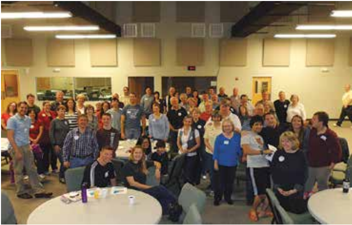
Saturday seminar at Hill Country Bible