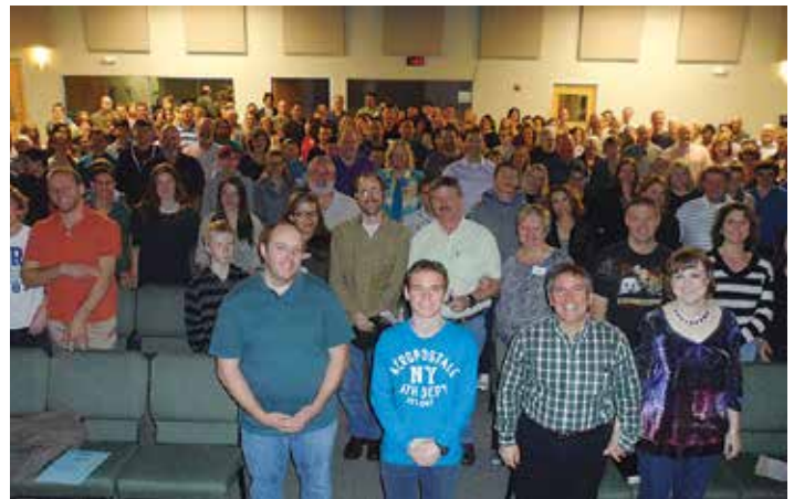
Sunday morning at Hill Country Bible

He did not exactly say that a person could lose everlasting life, but that is clearly what he meant. It has become common in Evangelical circles to teach that "initial salvation" is by faith and "final salvation" is by works.