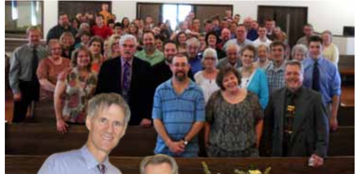
Above: Jansen Bible Church attendees

Everyone at Jansen Bible Church makes me feel right at home.