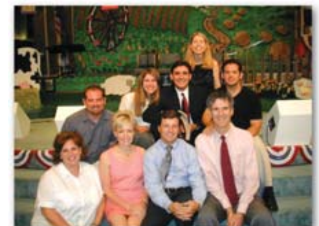
Fellowship after service at Ridge Pointe