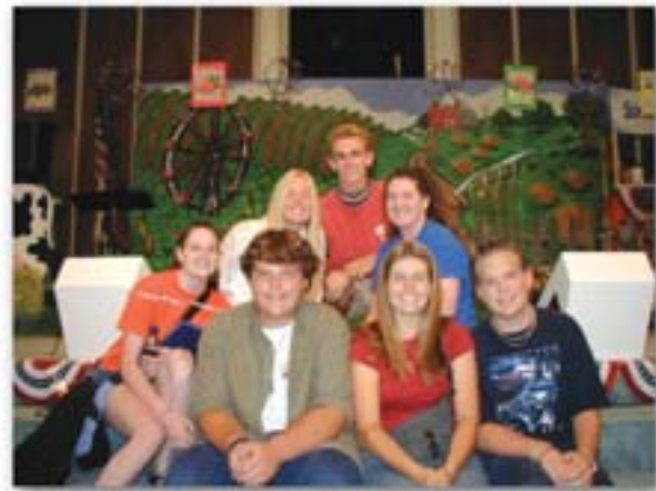
A group of youth from Ridge Pointe Fellowship