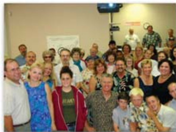
Some of the members of Simi Valley E-Free Church