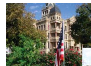
Courthouse on the Square