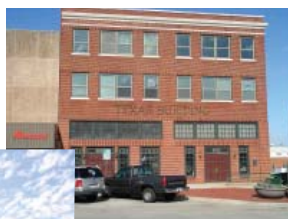
Our new Building