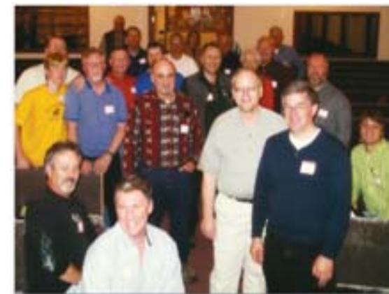
Ministry leaders at the NW Evangelical Free Church Pastor's Conference

Partners in Grace is a monthly magazine of: