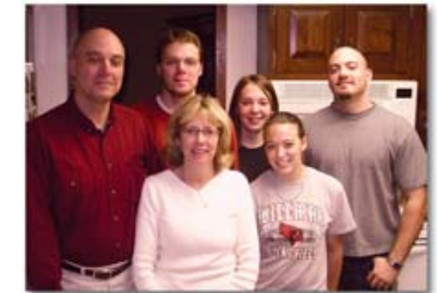
This is just some of the Radtke clan!