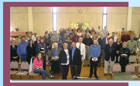
fort collins bible church

I covered some of my favorite passages: Matt 16:24-28, Luke 8:11-18, 2 Cor 5:1-11, Matt 7:21-23, and 1 Chron 13:5-14. I also dealt with one of my favorite topics: Eternal Security Is Good News. Everyone was very enthusiastic about the messages. We had lots of great Q & A. PG