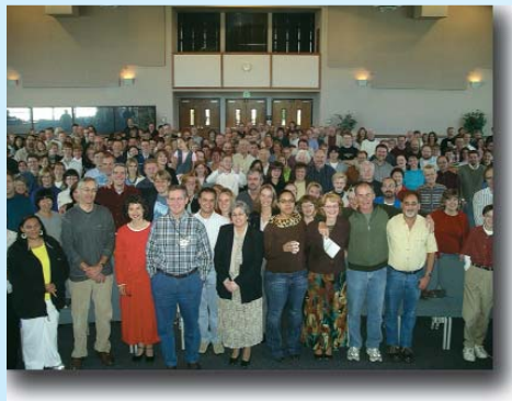
fbc, colorado springs