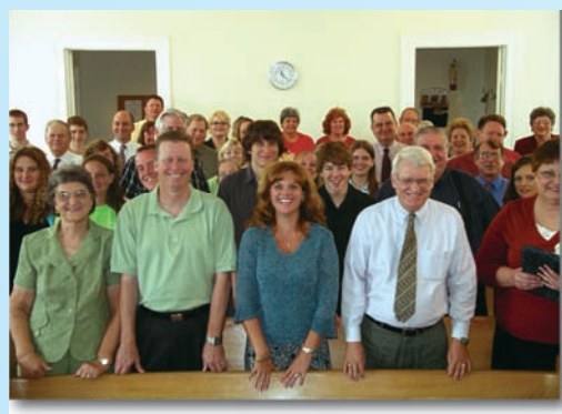
county line congregational church hampton, georgia

This message has been included in the Atlanta conference MP3. PG