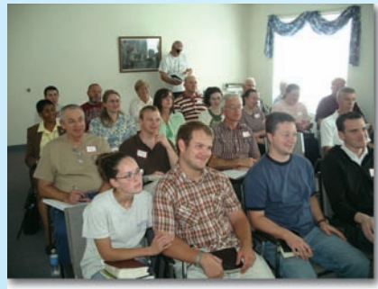
atlanta conference workshop