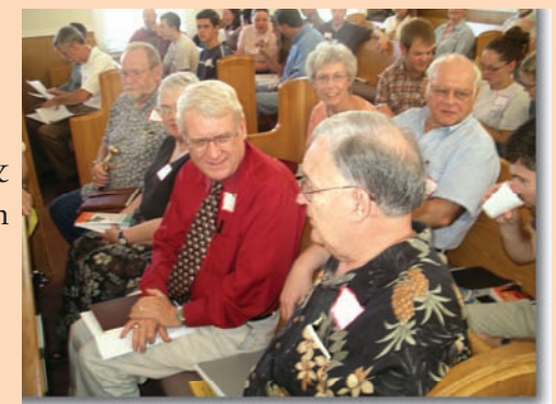
between sessions at atlanta conf