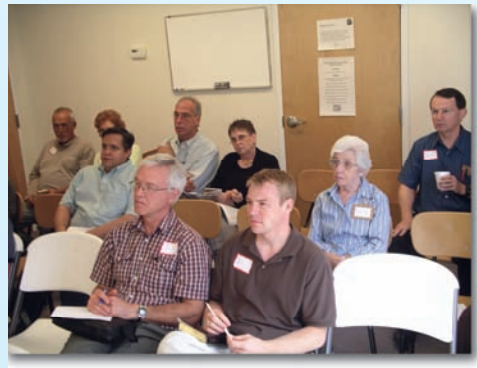
another atlanta workshop

[The conference was] well worth the time. Let's do it again. How encouraging [it was] to see a church full of grace people. I'm getting the [MP3] so that takes care of