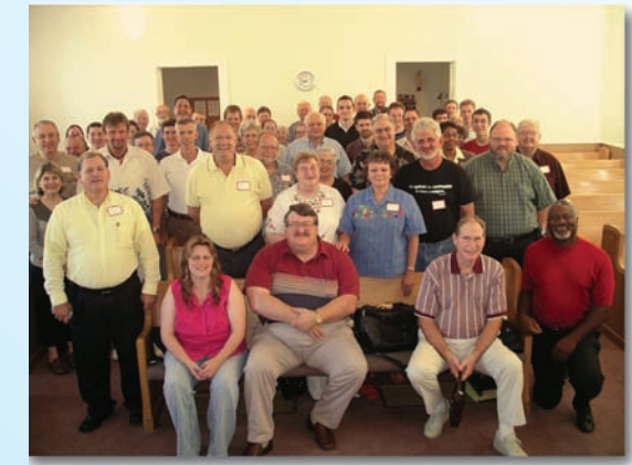
atlanta regional conference