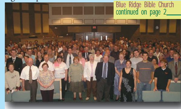
blue ridge bible church, kansas city, missouri

Blue Ridge Bible Church continued on page 2