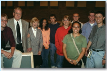
blue ridge bible church kansas city, missouri

blue ridge bible church continued from page 1