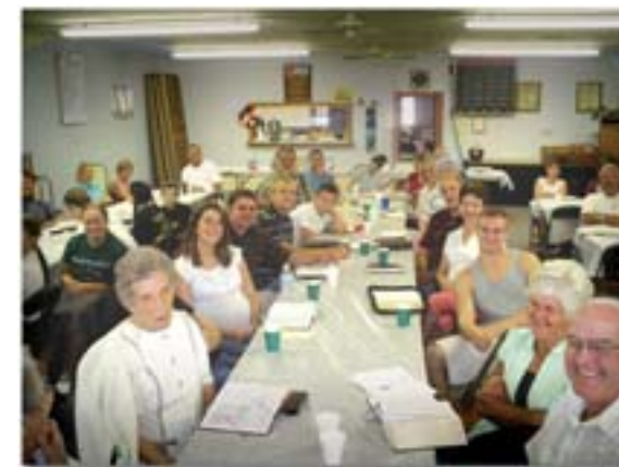
The "Accountability Table" in Whitewater, Kansas

Partners in Grace is a monthly magazine of: