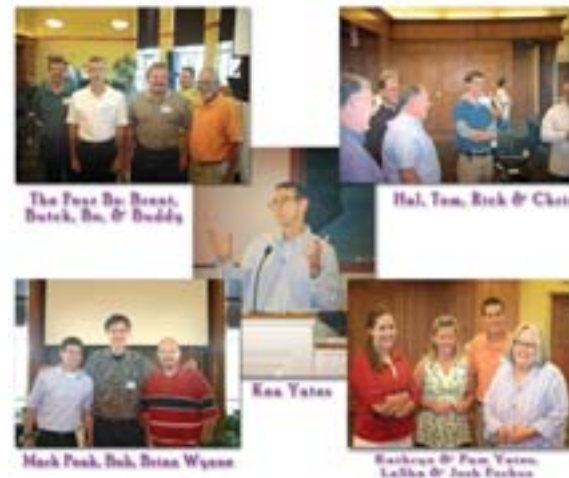
The Georgia Regional Conference was well attended and had some great speakers.