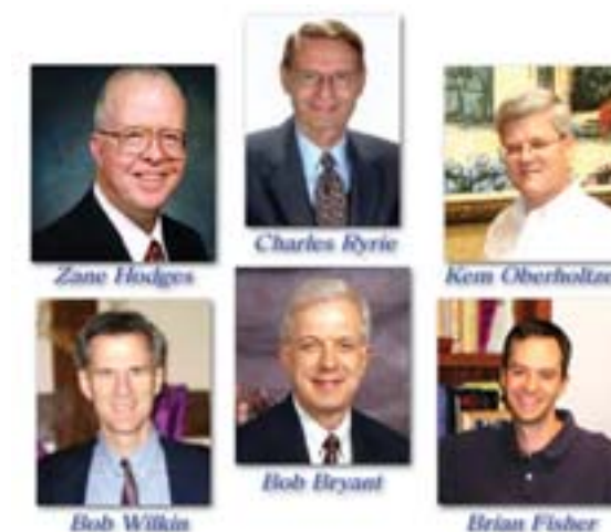
We have a great line-up for next year's Conference. Don't miss it!