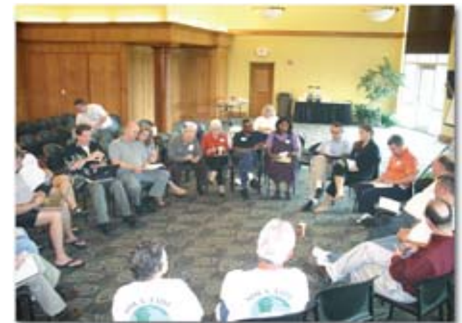
Q&A at the Georgia Regional Conference— Notice the "Sola Fide" Shirts!