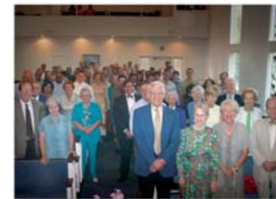
Bayside Community Church in Tampa, Florida

The commentary project is still lacking in funds, so if you are able to make a special gift to the commentary fund this month, it would be appreciated.