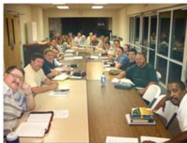
There was a good turnout for the seminar on Lordship Salvation at the Free Grace Seminary in Hampton, GA