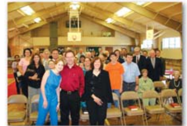
Berean Memorial on Sunday morning