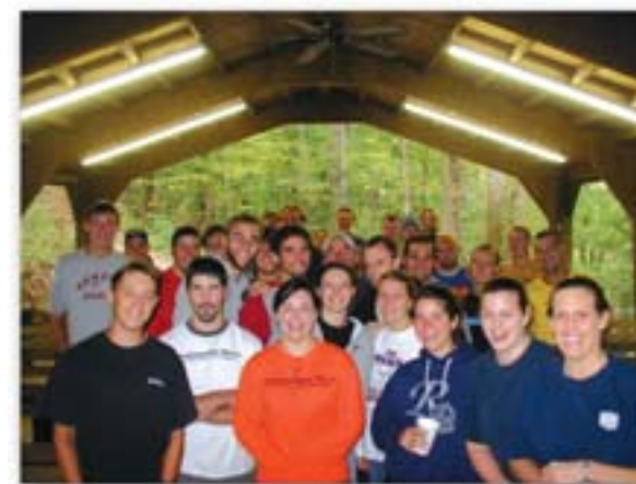
Before a meeting at the Ponca Bible Camp

A number of those who attended had spent one or more years in Bible Colleges. They had lots of questions both in the session and even more between sessions and at meals. It was great to answer lots of questions from thoughtful young men and women.