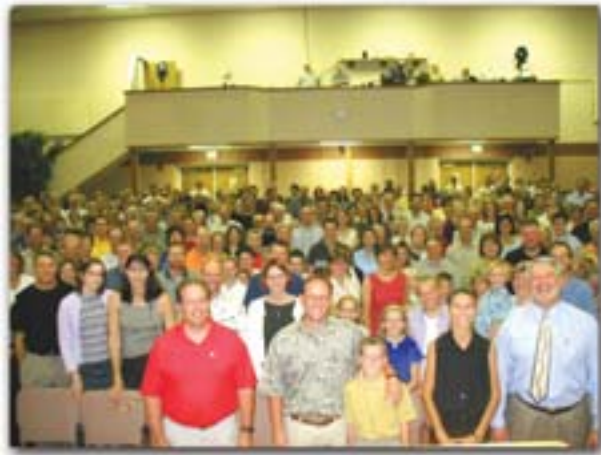
Sunday morning at First E-Free Church Bismarck