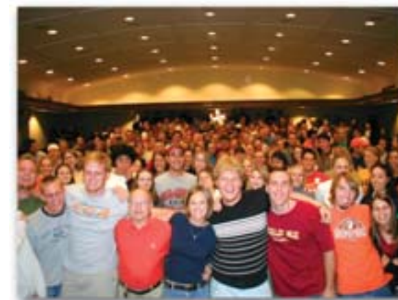
450 OSU students in a combined campus ministry meeting