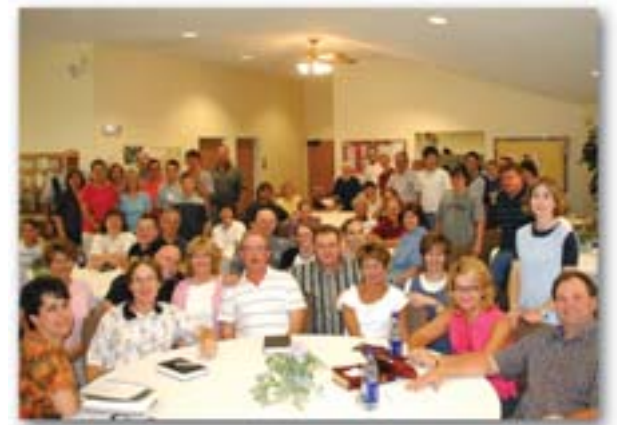
Sunday night at Liberty E-Free Church Williston