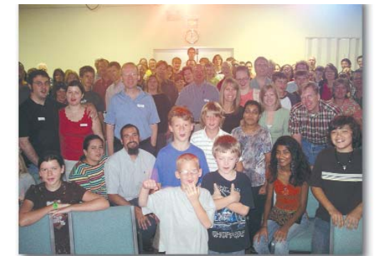
one of the three services at northwest community church

I also enjoyed a time of informal interaction on Saturday night with a few of the families in the church. PG