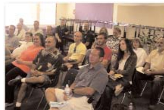
one of the workshops at the southern california grace conference