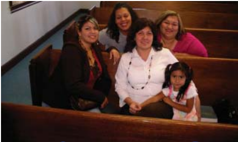
Victor Street Bible Chapel

Our summer Board meeting is August 4. We will iron out the new budget then.