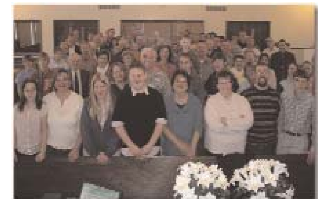
The congregation of Jansen Bible Church