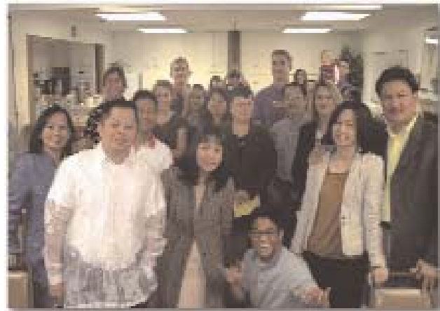
Church of Hope in Laguna Hills (CA) before Bob spoke