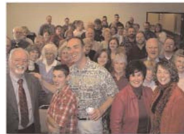
The group from Living Word Ministries in Montana