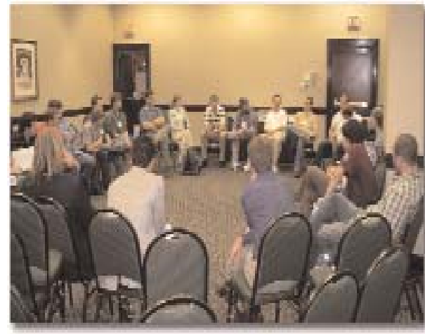
The next generation of Free Grace