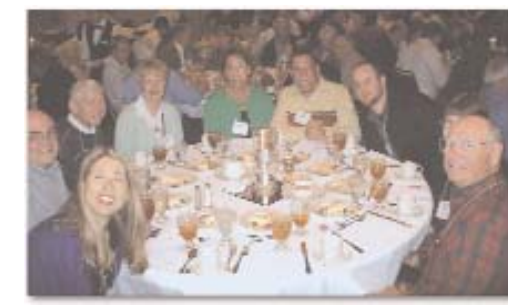
Conferees enjoying the banquet

The conference was wonderfully informative and thought provoking