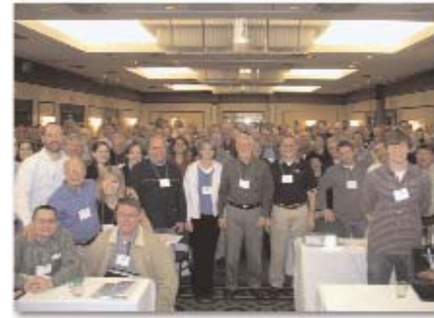
The 2006 Grace Conference!

The conference was wonderfully informative and thought provoking