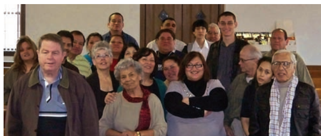
Victor Street Bible Chapel Congregation

In the Lord's Supper meeting I spoke on the topic, "Make Your Life Count," from 1 Cor 3:10-15. I shared some insights I've gained on that passage over the years.