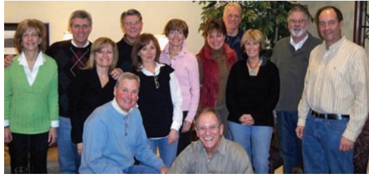
Bible Study Attendees