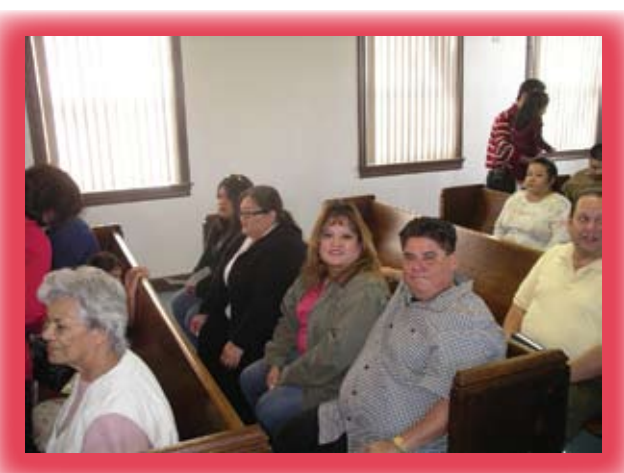
Victor Street Bible Chapel before the service began on January 21